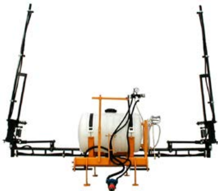
55 gallon sprayer/30' boom