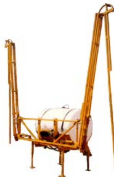
300 gallon sprayer/51' boom