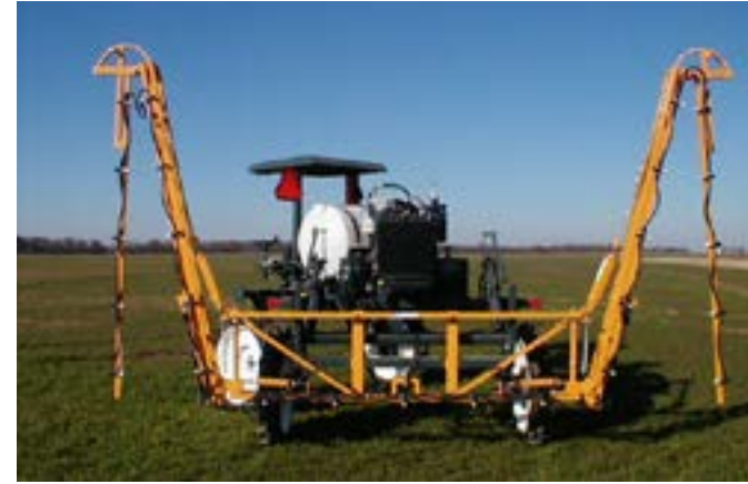
41 & 51 ft.