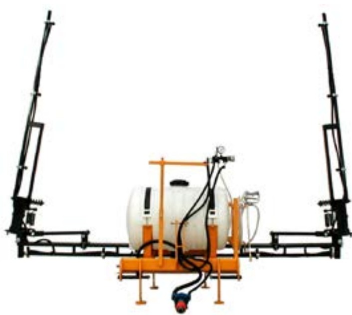
55 gallon sprayer/30' boom