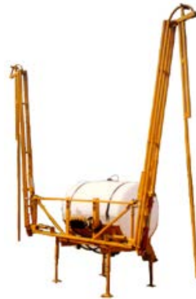
300 gallon sprayer/51' boom

When It Comes To Broadcast Spraying, The AgMate Has It Covered!