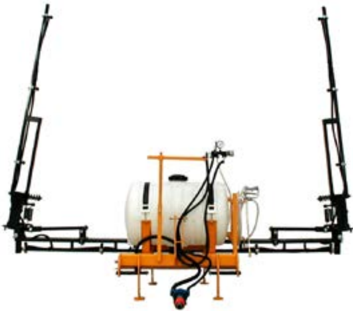
55 gallon sprayer/30' boom