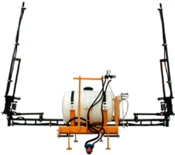
55 gallon sprayer/30' boom