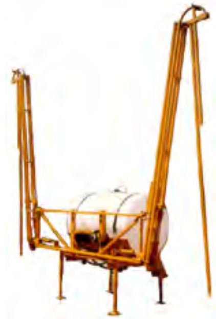
300 gallon sprayer/51' boom